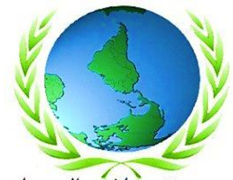
موسسه تحصیلات عالی جهان Jahan Institute of Higher Education

We are headed for a future in which educational institutions will increasingly be judged by the quality of the education they provide, by the kind of people they graduate and by the way in which those graduates choose to lead their lives. And we at Jahan University have been striving constantly to meet these challenges.