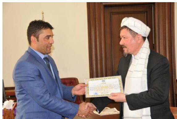
Jahan University Appreciation by Deputy of Parliament