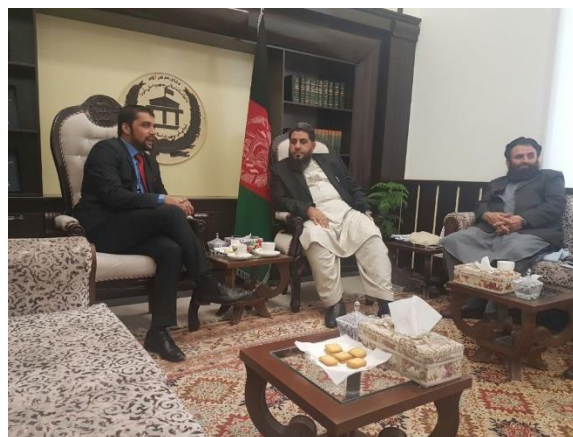
Chancellor With The Speaker Of Upper House