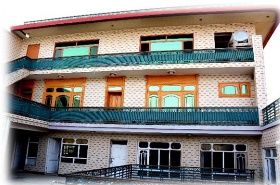
Jahan University hostel

Hostels are very well equipped, has got a very large area, shared rooms, big yard and the best location of Kabul City with 5 minutes distance to Jahan University.